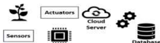
Fig. 2. System architecture of the Automated Urban Garden System.

The main components of the proposed system include environmental sensors for data collection, such as a soil moisture sensor that monitors water content to automate irrigation, a DHT11 sensor that measures temperature and humidity for environmental assessment, and an LDR sensor that detects light intensity to optimize plant growth. Additionally, the system features an automated irrigation mechanism where water pump activation is controlled based on real-time soil moisture levels. For cloud-based remote monitoring, an ESP8266 Wi-Fi module transmits data to Thing Speak for real-time visualization, while a 16x2 LCD module provides on-site display of environmental readings.