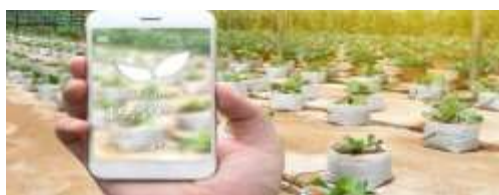
Fig. 1. Smart Garden System.

Urban gardening is becoming a crucial component of smart city infrastructure, promoting sustainability, reducing carbon footprints, and improving urban resilience. However, maintaining urban gardens requires continuous monitoring of environmental conditions such as soil moisture, temperature, humidity, and light intensity to optimize plant .and water usage. Traditional irrigation methods are often inefficient, leading to water wastage or plant stress, which necessitates automated, data-driven solutions.