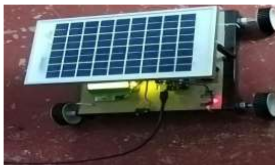
Fig: 2 system model

To increase the effectiveness of the pilot project, a performance analysis of the solar-charged vehicle system will be carried out. as a strategy to lessen carbon emissions in order to produce electricity