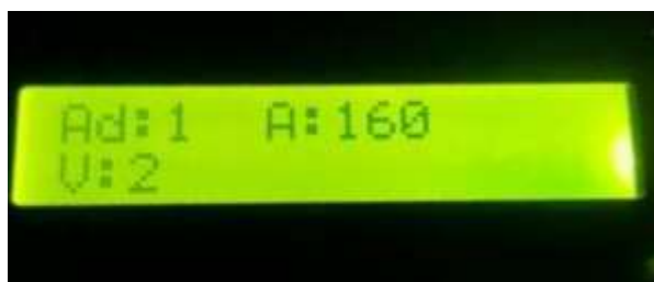
Fig: 3 Output result 1