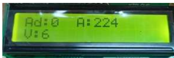
Fig: 3 Output result 2